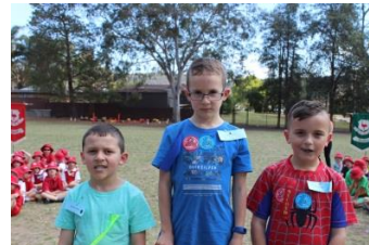
Boys – Lincoln M